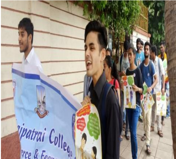
Hajiali. 28 Volunteers was there in

The students conducted a rally on HIV/AIDS awareness from Lotus to